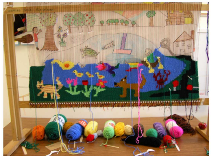
The loom with weaving about half way completed. Students did an amazing job of following their background "cartoon" faithfully.