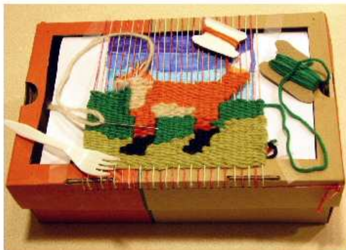
A sketch is taped behind the warp as a guide for weaving.

To make the holes for the warp threads, draw a straight line on the edge of the box lid about an inch from the top. Mark this off at 1/4 inch intervals. Do the same on the other side. Poke holes through the lid at your marks with a nail or heavy yarn needle.