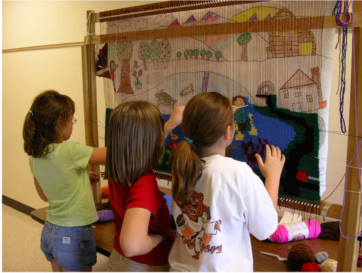
Three third grade students weaving on the loom.

2 YEAR PROJECT ~ 2004 - 2006 ~ HYL A SKUDDER ~ ARTIST-IN-RESIDENCE