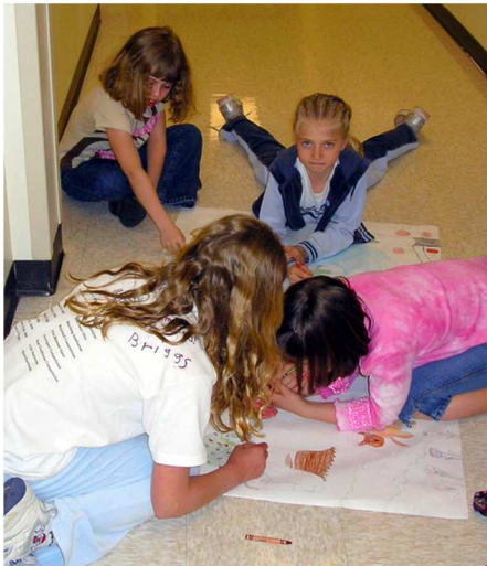
A group working on drawing the "cartoon" for the loom.