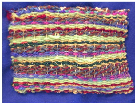
Details from students' shoebox weavings.