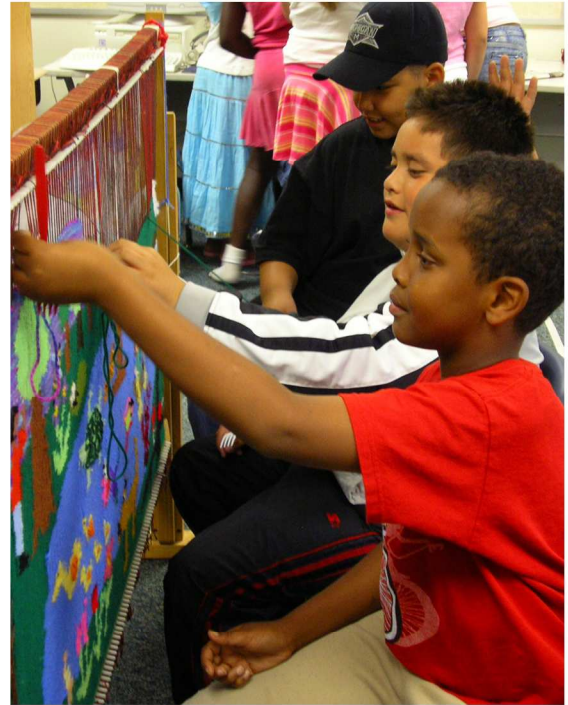
Three friends weaving during recess.

This project was started as a third grade project, and continued through 4th grade. Students learned the traditional art of tapestry weaving: working small areas of color into a detailed picture. Students voted on a theme, and worked collaboratively on the drawing, called a "cartoon" that is taped to the back of the loom as a guide for weaving. Students worked with Mrs. Skudder in small groups during recess and silent reading times.