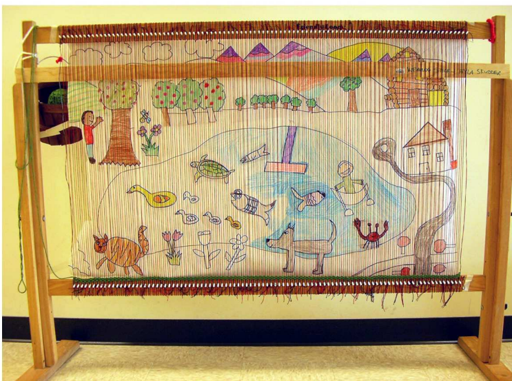
The loom with the "cartoon" taped up behind it so students could use it as a weaving guide.