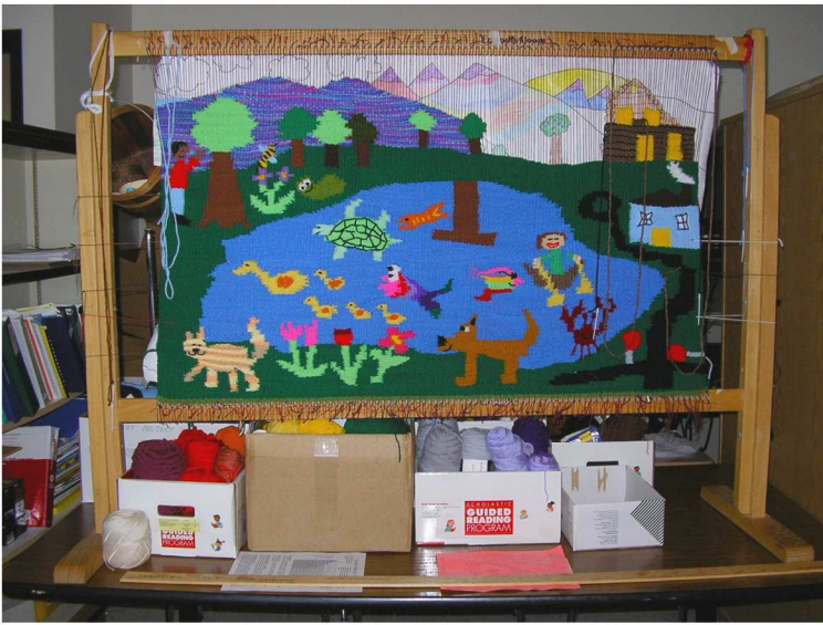
The weaving is almost done!