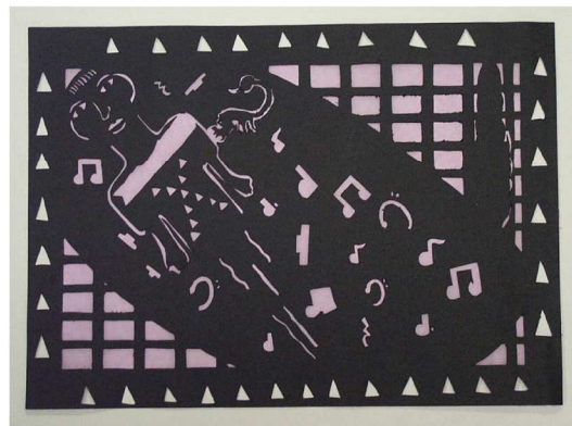
The use of background "connectors" throughout the illustration was very important to hold the paper together and give it a strong sense of design.