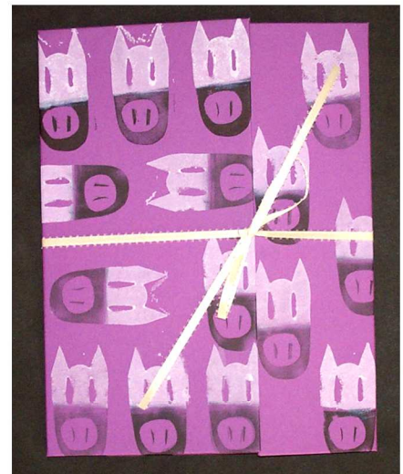
Some designs were refreshingly whimsical!