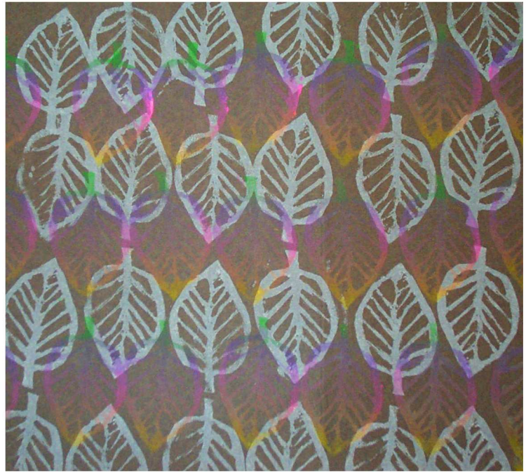
Sample of a student printed paper.

Making the Portfolios: The printed papers were wrapped around thin cardboard covers (cut from cereal boxes) that were slightly larger in all dimensions than a standard letter-sized sheet of paper. The printed papers were adhered to the covers with glue sticks, except for the edges for which a thick craft glue was used for durability.