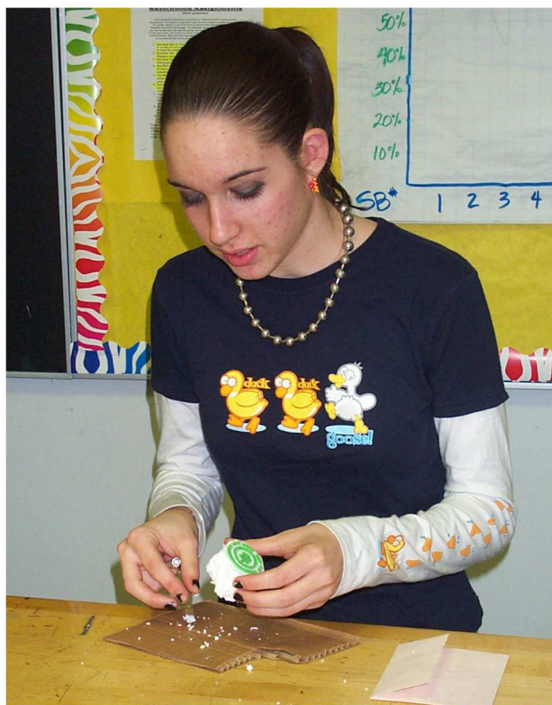
Student trimming the edges from her foam block to prevent unwanted areas from printing.

The Purpose: The students were studying Japanese and Chinese poetry, and writing their own original poems modeling these styles. This integrated art activity served to give students a further in depth understanding of Japanese artistic expression, and also served the practical purpose of storing their writings during the Asian Culture unit.