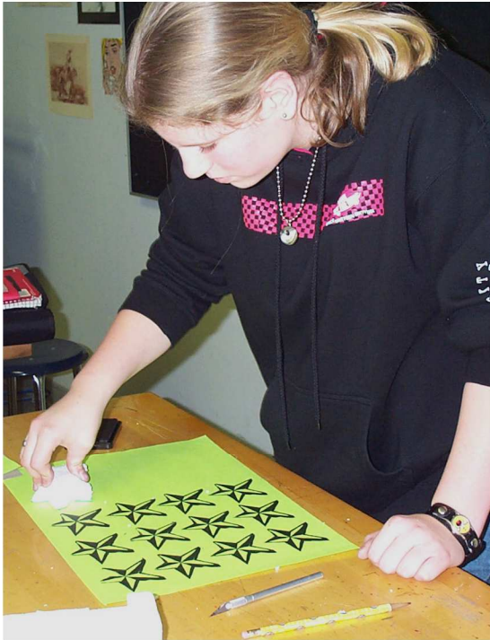
A student printing her design.

Students printed their rubber stamps on large sheets of heavy white or colored craft papers with colored ink pads. Multi-colored "rainbow" pads produced particularly striking results. Students experimented with tiling with their designs.