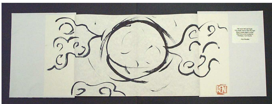
Finished painting with poem and red seal.

In Language Arts class, students studied examples of Chinese and Japanese poetry, and had written their own poem in Japanese Tanka form. In Art class, students created Japanese style sumi-e ink paintings to illustrate their poems. These paintings, with their poems, were bound into Japanese style accordian books, that I had worked with the students on in earlier class sessions.